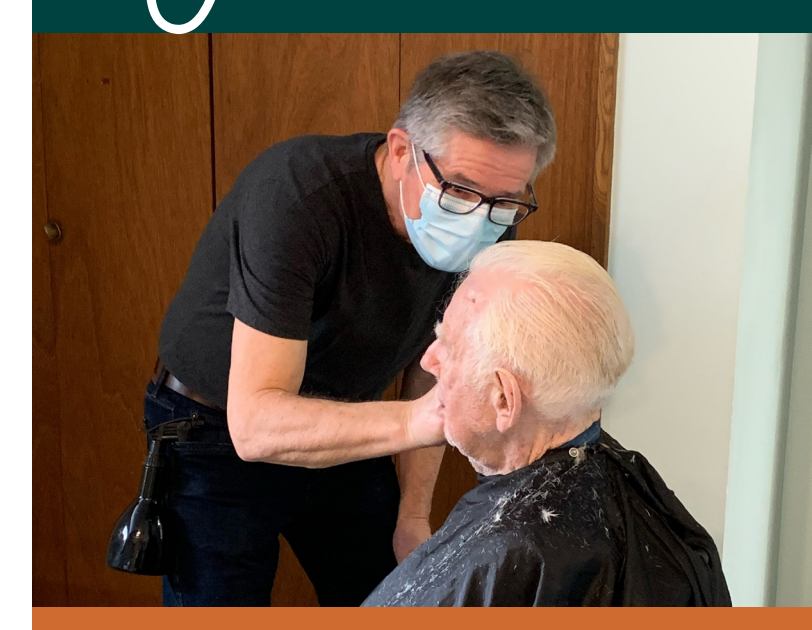
"Jocelyn House gave our father a quality of life in his end days that we never knew was possible."

As a family, Jocelyn House Hospice allowed us the peace in knowing all of our father's needs exceeded every expectation and helped us with our overwhelming emotions as well.