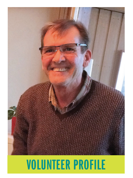
"My volunteer role is to prepare and serve supper, to provide companionship, and pet visits with my dog Maia."