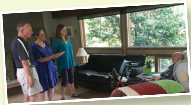
The angelic voices of 'Singing You Home' fill the House