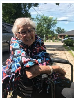
Chessie enjoying a walk in the neighbourhood.