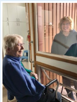
Window visits during the early stage of the pandemic ensured our residents could stay connected with their loved ones.