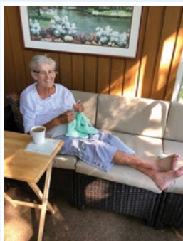
Our sunroom, overlooking the Seine River, is the perfect place to spend a summer afternoon.